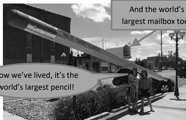
And the world's largest mailbox too!