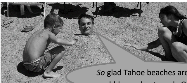
So glad Tahoe beaches are all pebbles and not sand. Ow.

P.P.S. Bet: There will be flying taxis or flying Ubers before you get 2 more of these letters. Any takers?